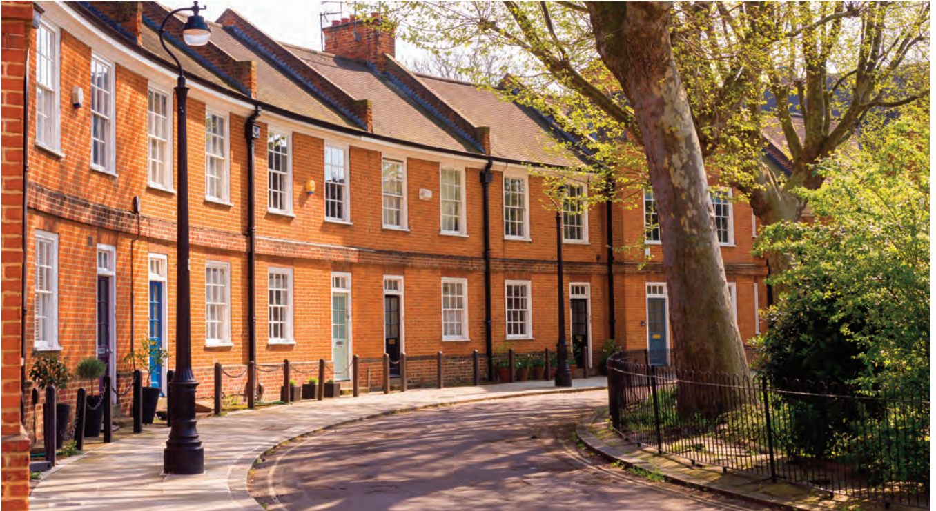
Traditional Timber Sashes

Nicholls and Clarke Glass Limited are pleased to announce the latest edition to their glass range of sealed units, Eco-Lite™ Slim Premium .