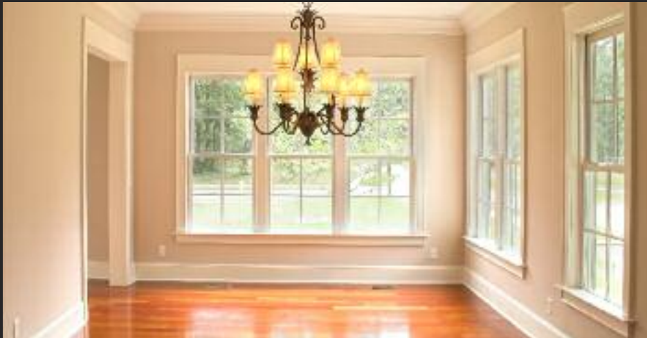
Eco-lite™ Slim Units - Heritage and Conservation