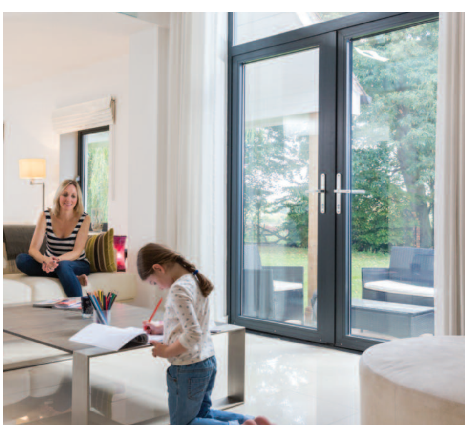
A new concept glass for year round comfort, keeping vou warm in winter and cool in summer