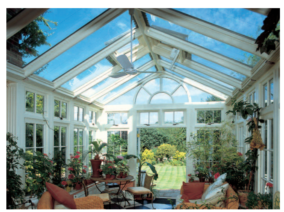
A subtle blue tint with low-maintenance Self-Cleaning

Keeping your conservatory cooler in summer is integral to the enjoyment you'll get out of this new living space and Eco-Lite™ Activ-Blue helps keep internal temperatures cooler whilst still maintaining excellent light transmittance.