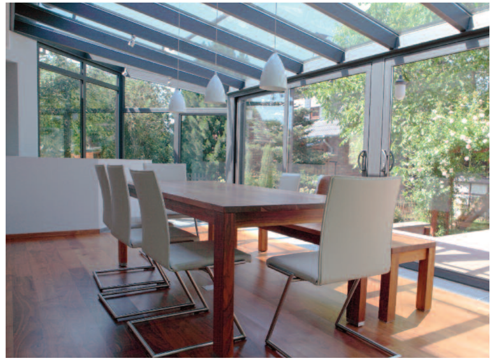
Bring the outdoors inside with Activ-Sunshade Neutral

Boasting solar control performance, Eco-Lite™ Activ-Sunshade Neutral helps keep temperatures cool in the summer, whilst maintaining excellent light transmittance. Eco-Lite Activ-Sunshade Neutral also uses UV rays and natural rainwater to break down and wash away organic dirt from the outside so you can maintain the cleanliness of your glass with minimal effort.