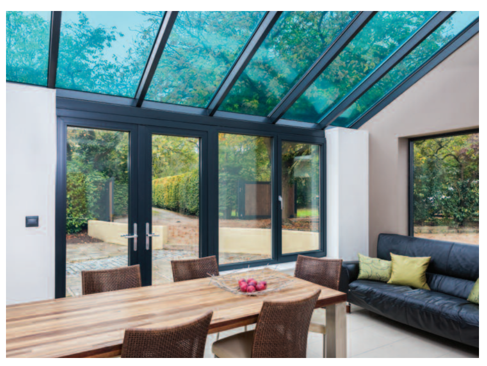
Activ-Sunshade Blue tinted roof glass with low-maintenance Self-Cleaning and Solar Control