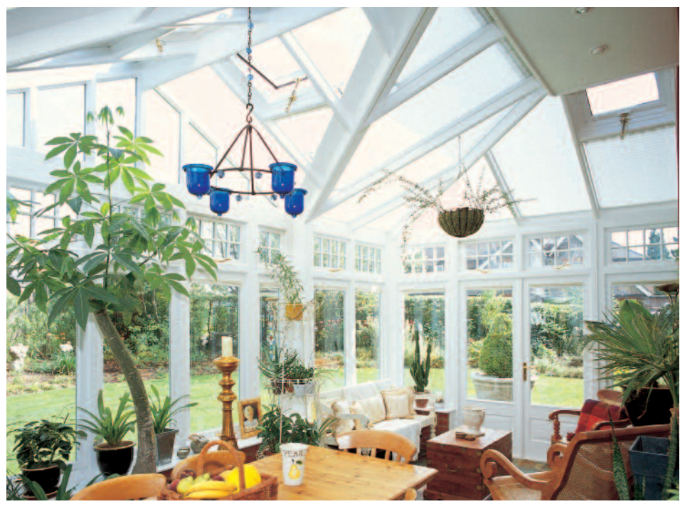
Clear glass with added low-maintenance Self-Cleaning

The second stage occurs when rainwater hits the glass. Through its hydrophilic form, water droplets are formed over the surface of the glass as it runs off taking the dirt with it. Compared with conventional glass, the water also dries off very quickly without leaving unsightly drying spots.